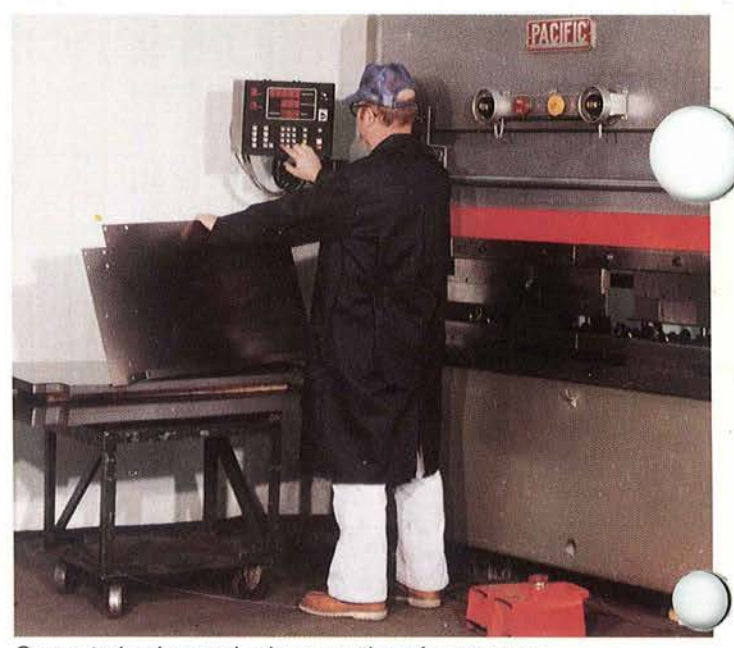
Computerized press brake operations for accuracy.