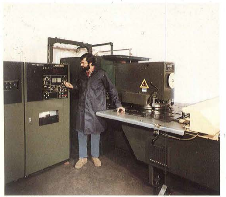
CNC turret press for special product applications.