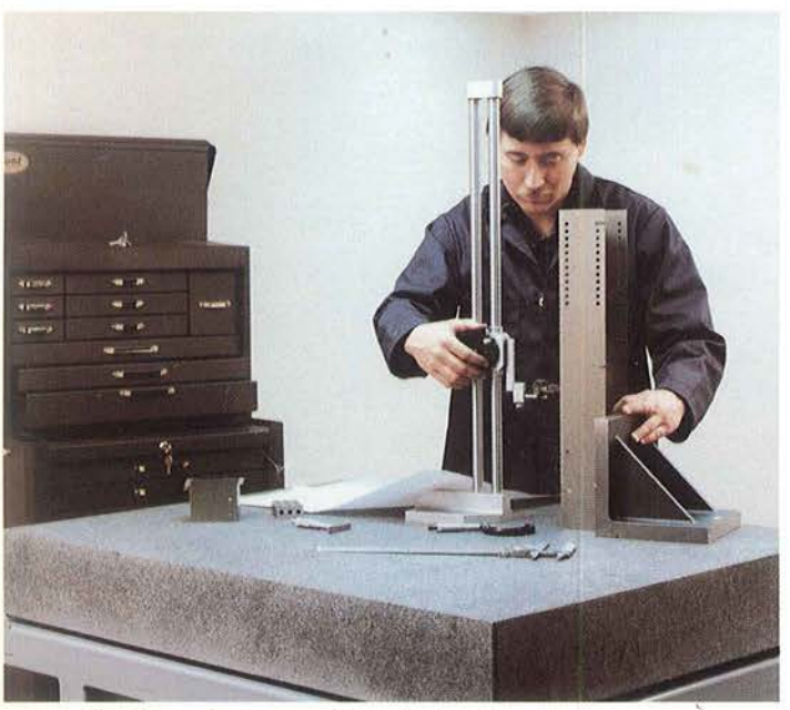
Quality control inspection of all parts.