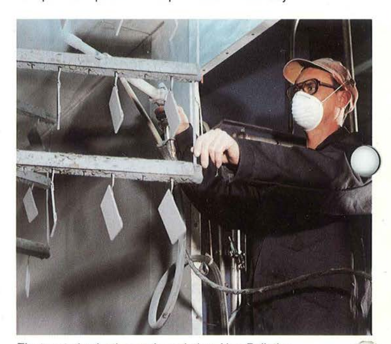
Electro-static plastic powder painting. Non-Polluting, tough-durable finish on all products.